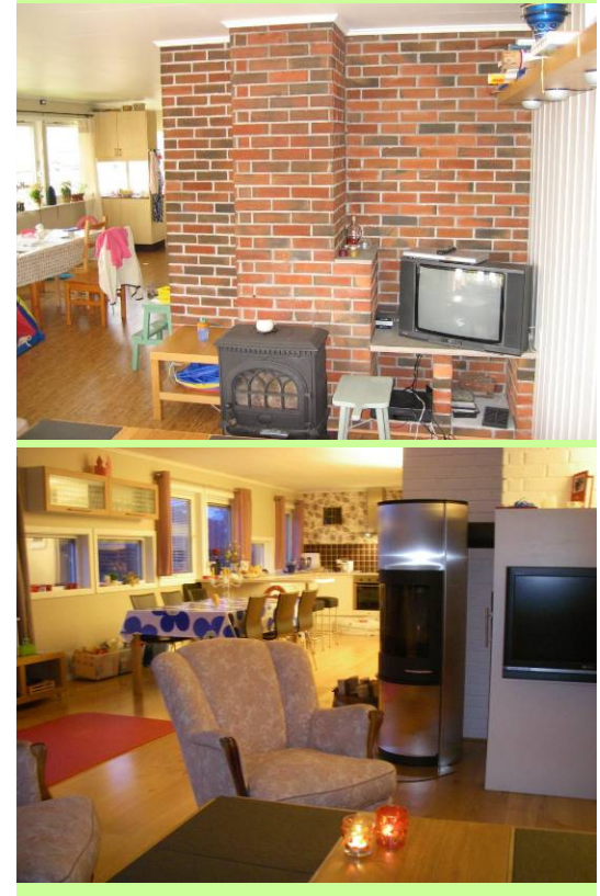
Living room, first floor, after renovation